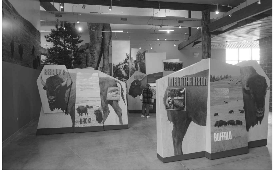
The Custer State Park Bison Center helps educate visitors about the history and importance of the herd of 1,400 buffalo that live in the park.

The biggest day of the year for the Bison Center comes in September during Custer State Park's annual Buffalo Roundup and Arts Festival. This year's event is scheduled for Sept. 28-30. The roundup itself is Sept. 29. Parking lots will open at 6:15 a.m. Mountain Time for people