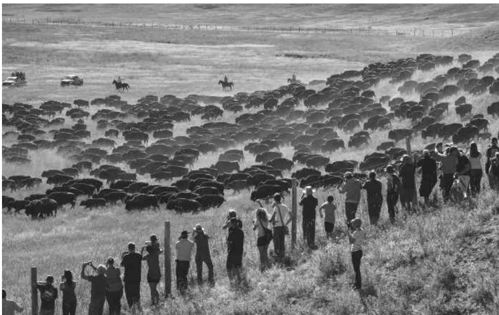
The Custer State Park Buffalo Roundup each September is popular with tourists and helps the state manage the bison that live in the park.

To learn more about the Custer State Park Bison Center, visit gfp.sd.gov/csp-bison-center/ .