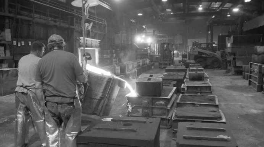
It took nearly 10 years to build a Case 150-horsepower steam-powered tractor from scratch.

Not with the Ladies of Steam. The program is run by women and offers other women a chance to learn about and ride an old-fashioned steam tractor.