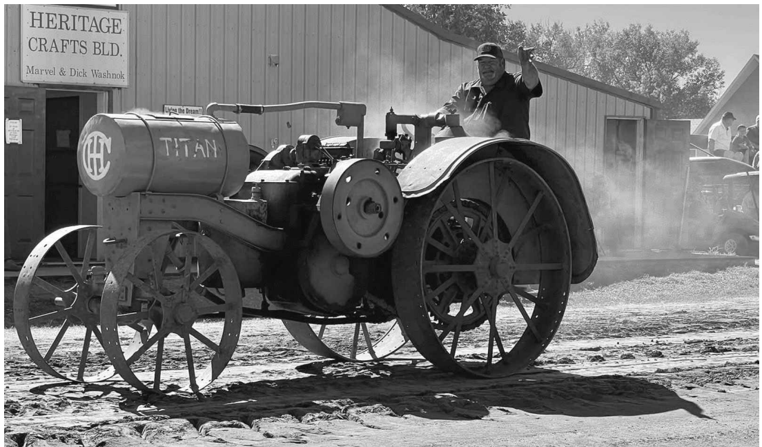
A parade with more than 250 entries each year is one of the most popular events during the James Valley Threshing Show in Andover each September.