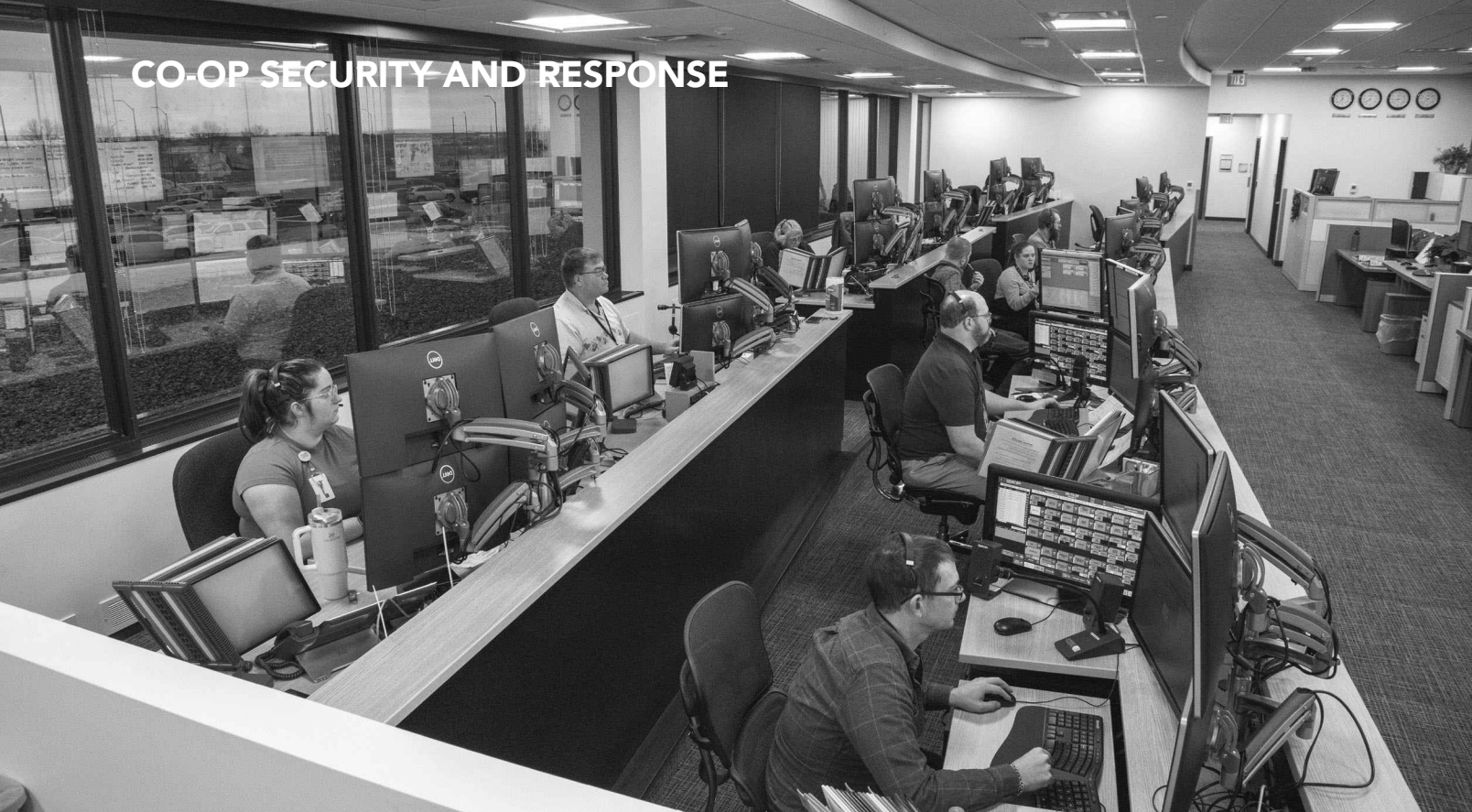
Basin Electric Security and Response Services dispatchers take calls from rural electric cooperative members at Basin's headquarters in Bismarck, N.D.