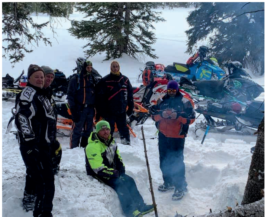
Watertown’s South Dakota Snowmobile Club members take a break during an outing.

More information on the state’s snowmobile clubs can be found at the SDSA’s website at snowmobilesd.com .