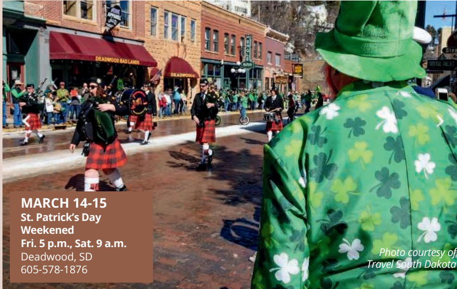
MARCH 14-15 St. Patrick's Day Weekened Fri. 5 p.m., Sat. 9 a.m. Deadwood, SD 605-578-1876