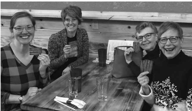
(Above) Trivia Night winners in Madison.