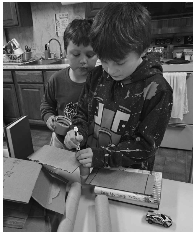
(Right) Gregory students work on a cardboard bridge.