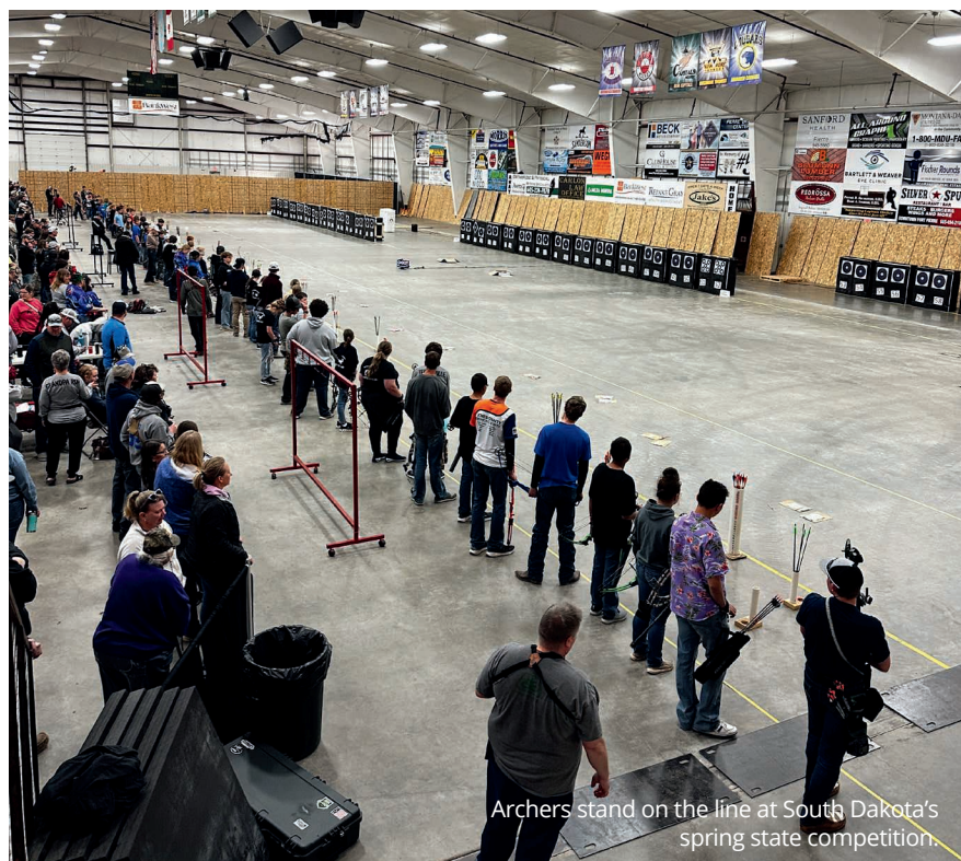
Archers stand on the line at South Dakota’s spring state competition.