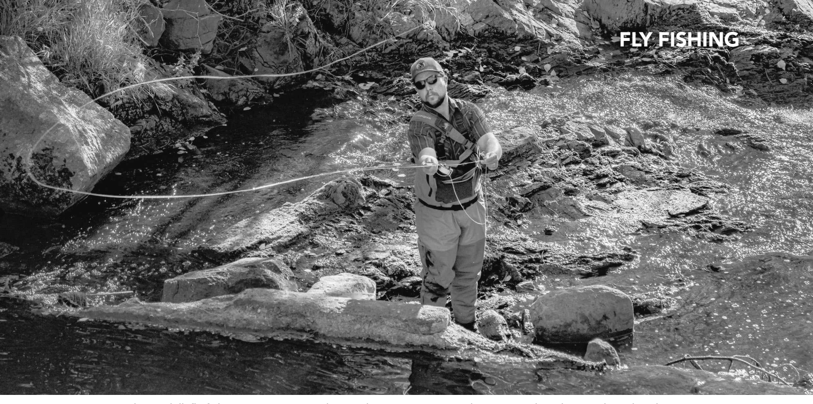
Part art and part skill, fly fishing is an increasingly popular pastime across the region.

26 years ago and how he started tying his own flies as a college student.