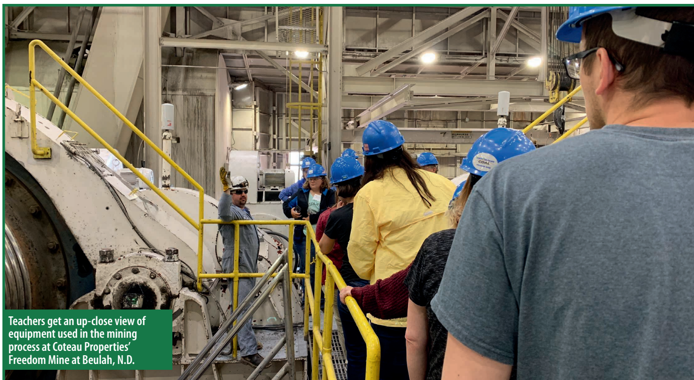
Teachers get an up-close view of equipment used in the mining process at Coteau Properties' Freedom Mine at Beulah, N.D.