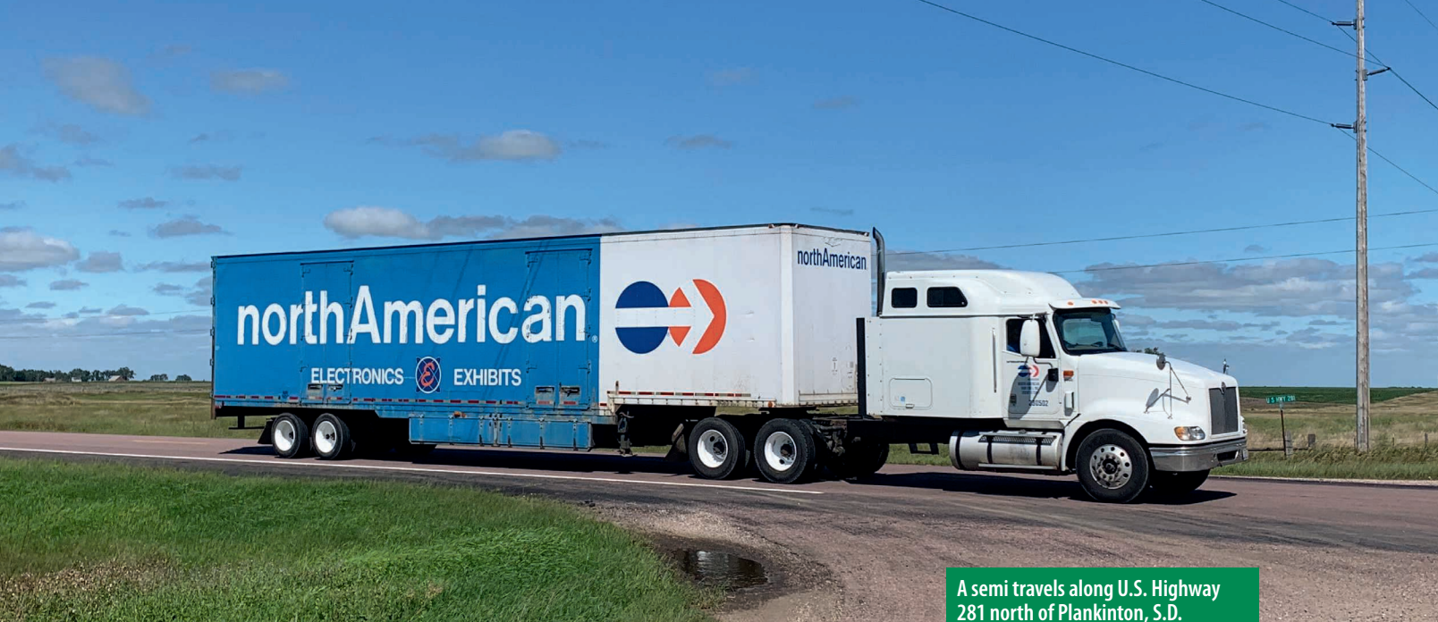
A semi travels along U.S. Highway 281 north of Plankinton, S.D.

46 years old, and almost as alarming is that the average age of a new driver being trained is 35 years old.