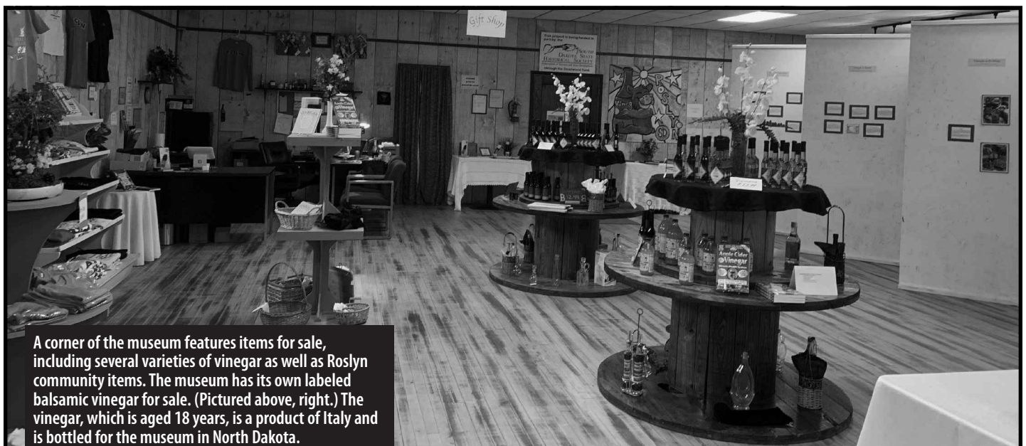
A corner of the museum features items for sale, including several varieties of vinegar as well as Roslyn community items. The museum has its own labeled balsamic vinegar for sale. (Pictured above, right.) The vinegar, which is aged 18 years, is a product of Italy and is bottled for the museum in North Dakota.