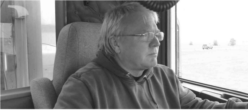
More than 8 million workers are employed in the U.S. trucking industry.

Approximate number of combined miles logged by