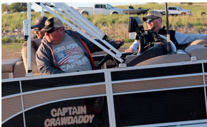
Crew members of the Captain Crawdaddy prepare to launch at Cow Creek.