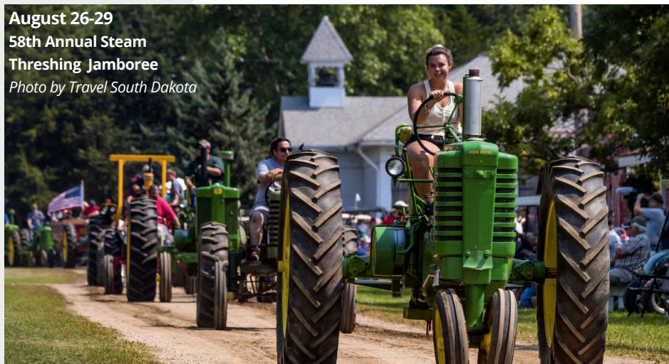
August 26-29 58th Annual Steam Threshing Jamboree

To have your event listed on this page, send complete information, including date, event, place and contact to your local electric cooperative. Include your name, address and daytime telephone number. Information must be submitted at least eight weeks prior to your event. Please call ahead to confirm date, time and location of event.