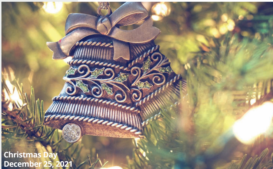
Christmas Day December 25, 2021

To have your event listed on this page, send complete information, including date, event, place and contact to your local electric cooperative. Include your name, address and daytime telephone number. Information must be submitted at least eight weeks prior to your event. Please call ahead to confirm date, time and location of event.