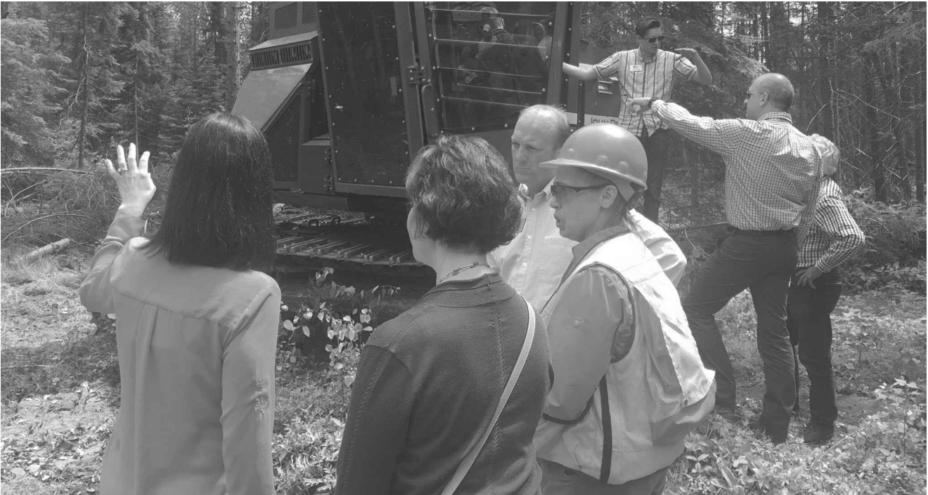
Leadership students take a field tour of a logging operation in northern Minnesota.