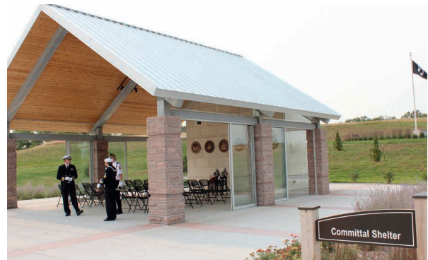
The Committal Shelter is the site of many outdoor funeral services for veterans.