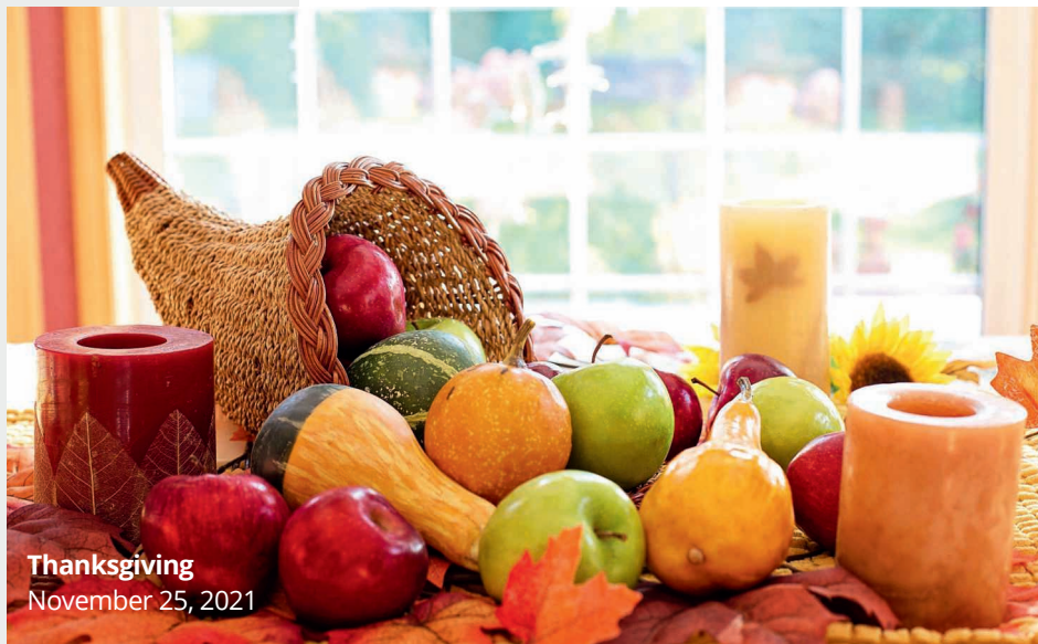
Thanksgiving November 25, 2021

To have your event listed on this page, send complete information, including date, event, place and contact to your local electric cooperative. Include your name, address and daytime telephone number. Information must be submitted at least eight weeks prior to your event. Please call ahead to confirm date, time and location of event.