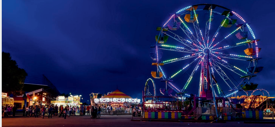
South Dakota State Fair September 2-6, 2021

To have your event listed on this page, send complete information, including date, event, place and contact to your local electric cooperative. Include your name, address and daytime telephone number. Information must be submitted at least eight weeks prior to your event. Please call ahead to confirm date, time and location of event.