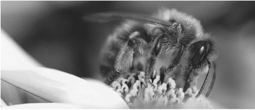
Honey bees pollinate roughly one-third of the world's agriculture crops.